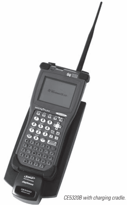
CE5320B with charging cradle.

The CE5320B incorporates an Intel® 520MHz Bulverde processor to maximize field performance. 128Mb of RAM and 256Mb of internal Flash memory provide ample storage for multiple routes of meter reading data. Communication of data from the CE5320B is conducted through an Ethernet cradle at speeds up to 10Mbps – almost 100 times faster than conventional serial communications. The cradle also serves as a charging device designed to intelligently “fast charge” the unit’s rechargeable lithium ion batteries in only four hours. The CE5320B power supply is designed to provide continuous use for a full, productive work day.