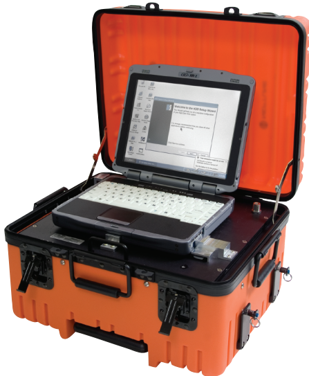
The MRX920™ unit can be easily and safely installed in almost any vehicle within minutes.

Neptune's MRX920 is a rugged, portable, easy-to-use automatic meter reading device. Within minutes, the MRX920 can be securely placed in the passenger seat of any vehicle with a standard seat belt and powered via the vehicle power source.